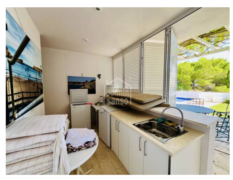
The information shown is provided by third parties for information only and are assumed correct. The data are subject to errors, price changes and withdrawal without notice.