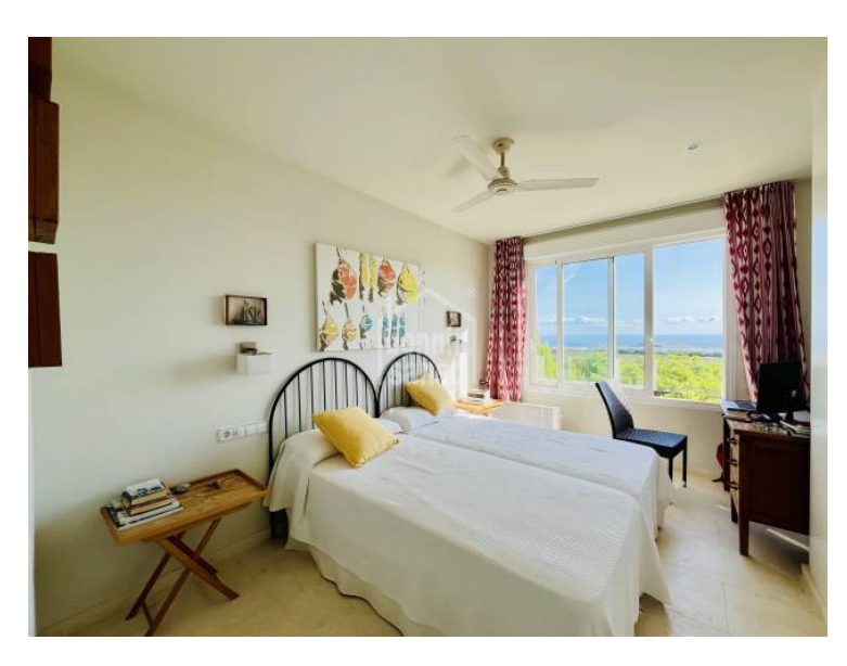
The information shown is provided by third parties for information only and are assumed correct. The data are subject to errors, price changes and withdrawal without notice.