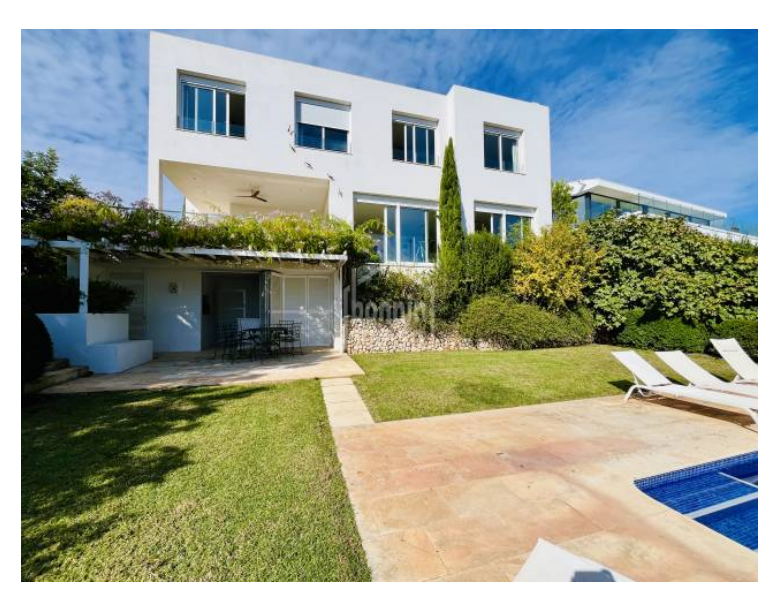
The information shown is provided by third parties for information only and are assumed correct. The data are subject to errors, price changes and withdrawal without notice.