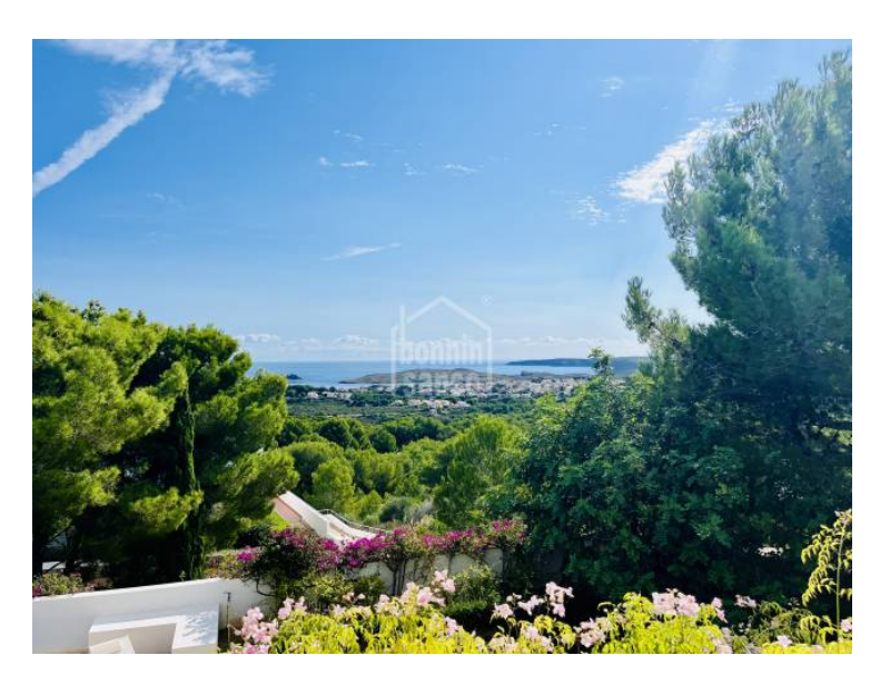
The information shown is provided by third parties for information only and are assumed correct. The data are subject to errors, price changes and withdrawal without notice.