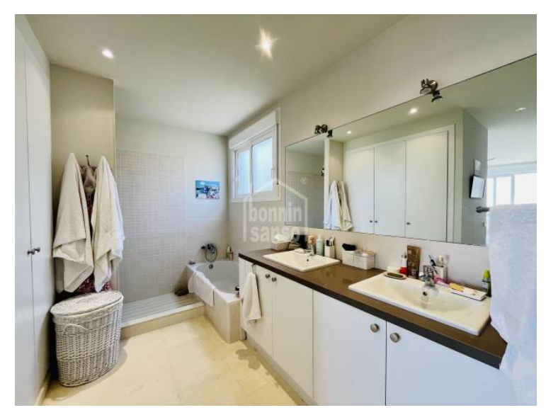
The information shown is provided by third parties for information only and are assumed correct. The data are subject to errors, price changes and withdrawal without notice.