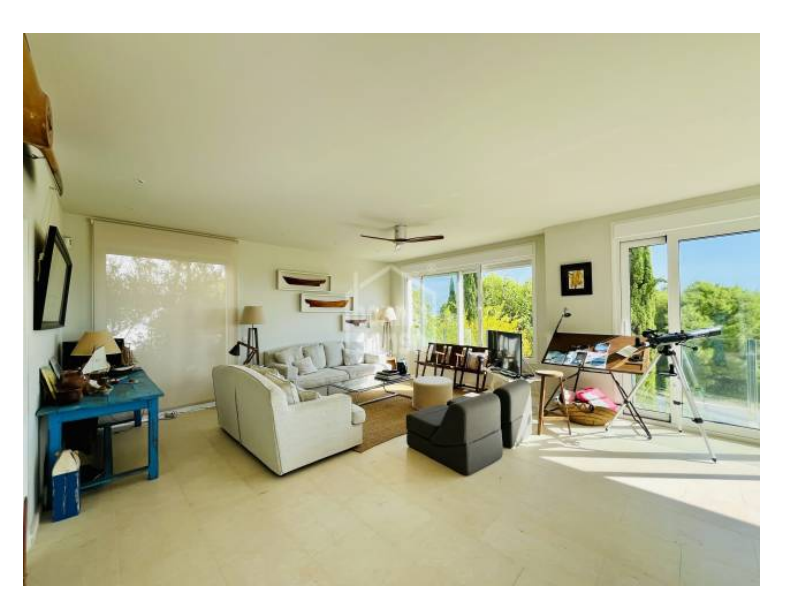
The information shown is provided by third parties for information only and are assumed correct. The data are subject to errors, price changes and withdrawal without notice.