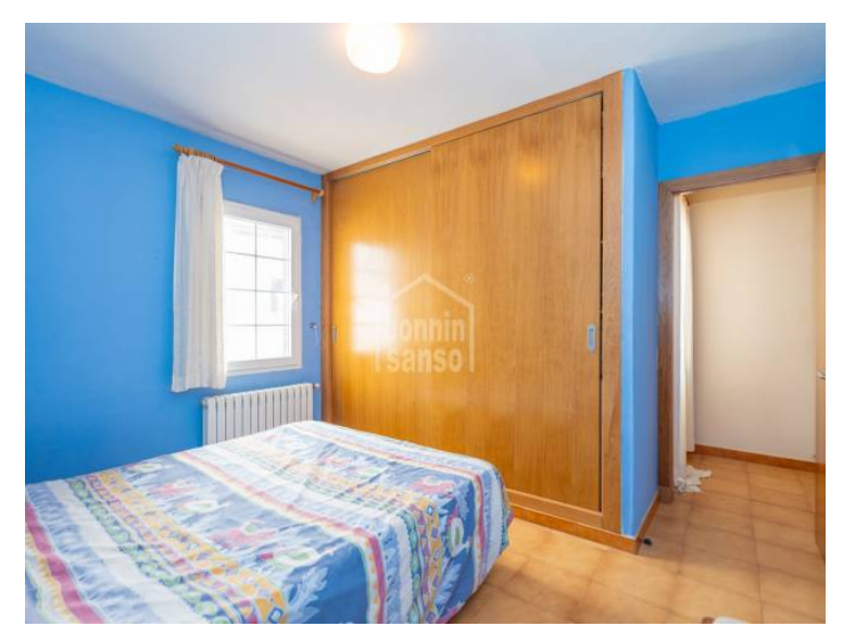
The information shown is provided by third parties for information only and are assumed correct. The data are subject to errors, price changes and withdrawal without notice.