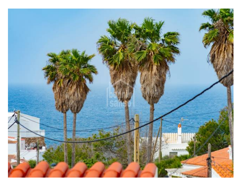
The information shown is provided by third parties for information only and are assumed correct. The data are subject to errors, price changes and withdrawal without notice.