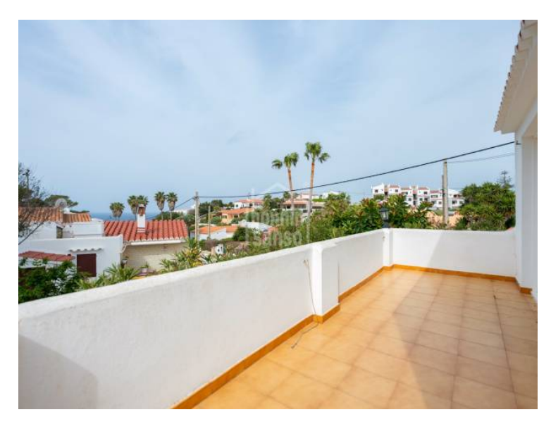
The information shown is provided by third parties for information only and are assumed correct. The data are subject to errors, price changes and withdrawal without notice.