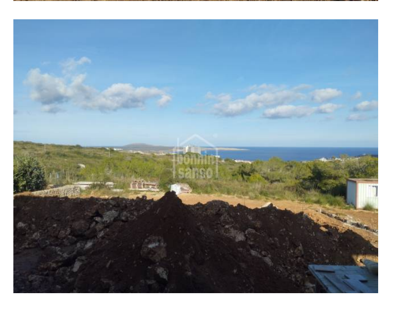
The information shown is provided by third parties for information only and are assumed correct. The data are subject to errors, price changes and withdrawal without notice.