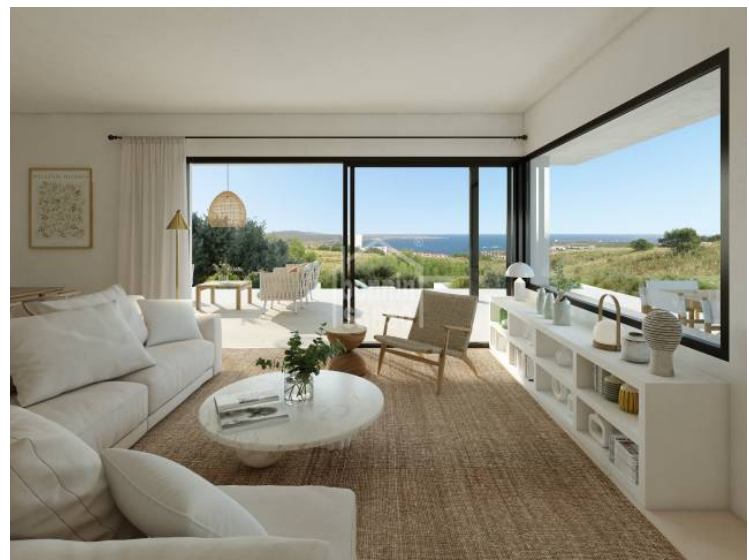
The information shown is provided by third parties for information only and are assumed correct. The data are subject to errors, price changes and withdrawal without notice.