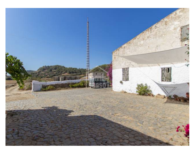
The information shown is provided by third parties for information only and are assumed correct. The data are subject to errors, price changes and withdrawal without notice.