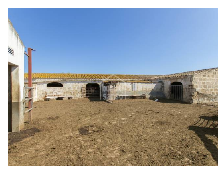
The information shown is provided by third parties for information only and are assumed correct. The data are subject to errors, price changes and withdrawal without notice.