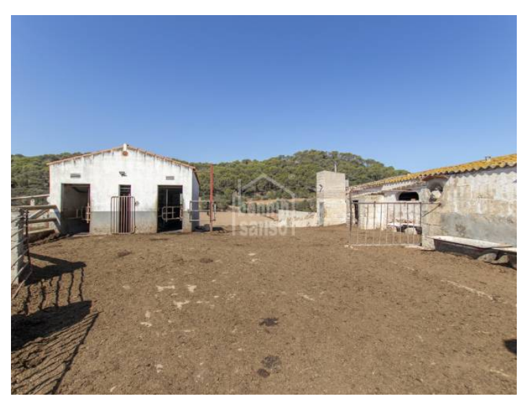
The information shown is provided by third parties for information only and are assumed correct. The data are subject to errors, price changes and withdrawal without notice.