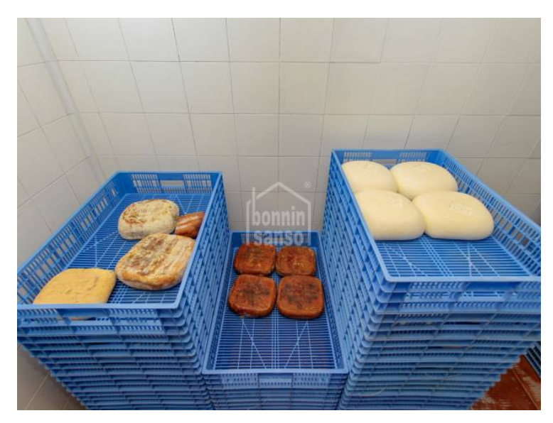
The information shown is provided by third parties for information only and are assumed correct. The data are subject to errors, price changes and withdrawal without notice.